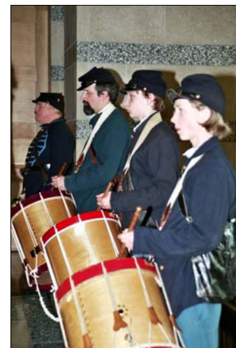
First Minnesota Field Music